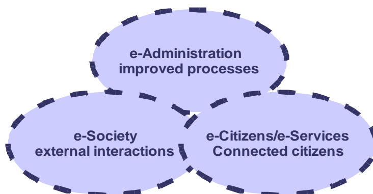
Figure 1: Overlapping domains of e-Government (adapted from Heeks, 2001)

Practically speaking, the three domains of e-governance are seldom separate in their implementations; rather, they involve overlapping activities as part of the same initiative. To put it more strongly: good e-governance programmes must take into account all three domains.